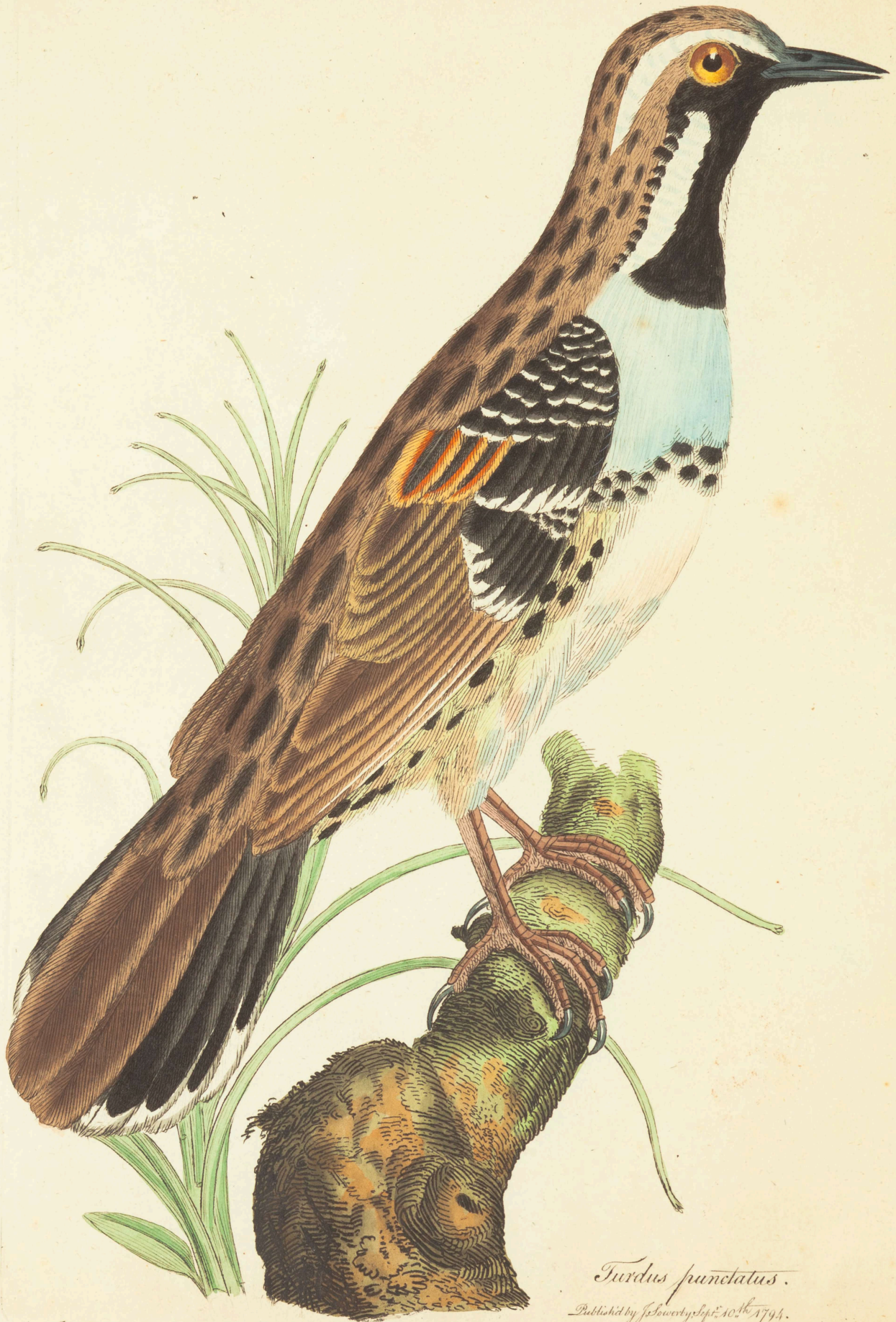
Turdus punctatus. Published by Schoonhoven, Sept. 10 th 1794.